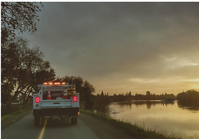
A Department of Utilities crew monitors a levee during the January 2023 storms.

City facilities provided more than 900 bed nights to unsheltered residents during the storms. DCR conducted daily outreach in flood prone areas and coordinated with SacRT to ensure transportation for people.